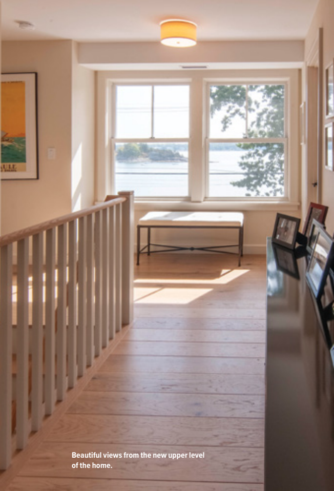
Beautiful views from the new upper level of the home.