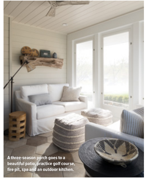
A three-season porch goes to a beautiful patio, practice golf course, fire pit, spa and an outdoor kitchen.