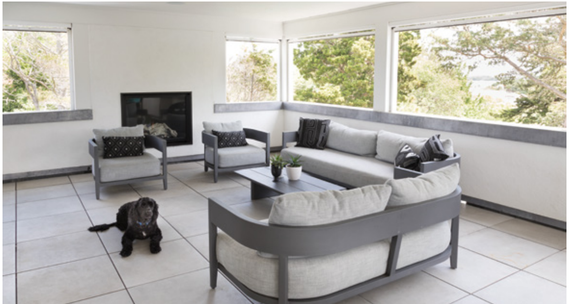
▶ Another unusual design feature are the two covered porches built into the side of the house, each with a deck above. The rooms are waterproofed, but assuming some water will find its way into the space, there are also built-in scuttles to drain the water out. Each covered porch also features drop-down screens that then retreat back upon themselves. The black sash windows are stellar, not overpowered by a full, heavy black jam. (only one of the rooftop decks shown.)