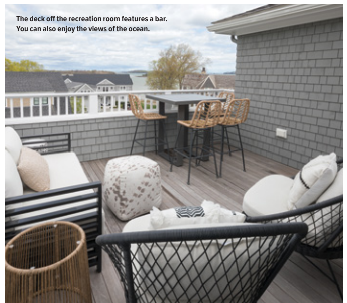
The deck off the recreation room features a bar. You can also enjoy the views of the ocean.