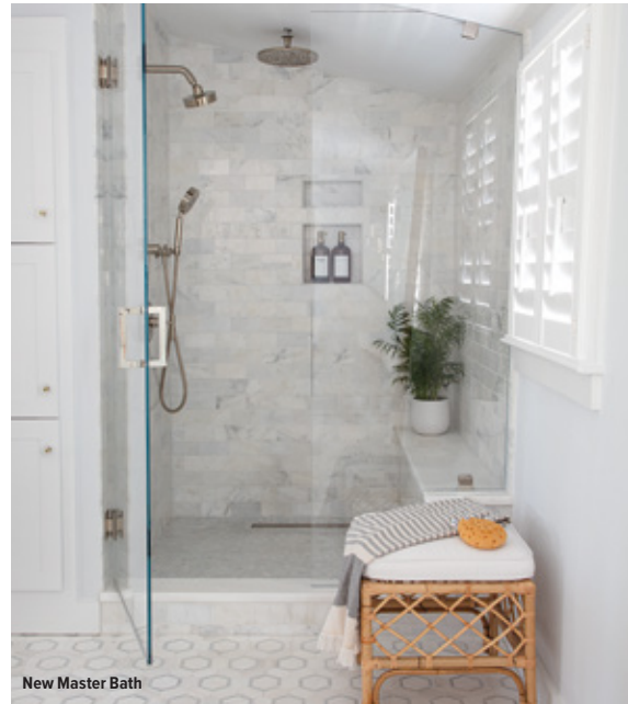
New Master Bath