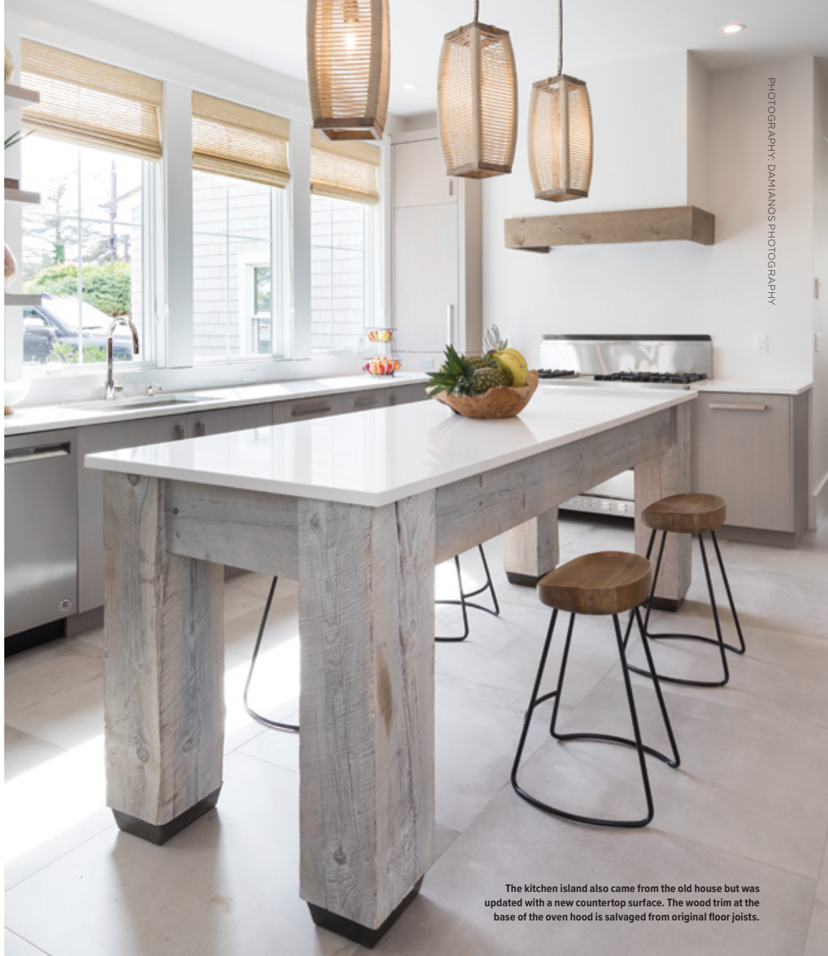
The kitchen island also came from the old house but was updated with a new countertop surface. The wood trim at the base of the oven hood is salvaged from original floor joists.