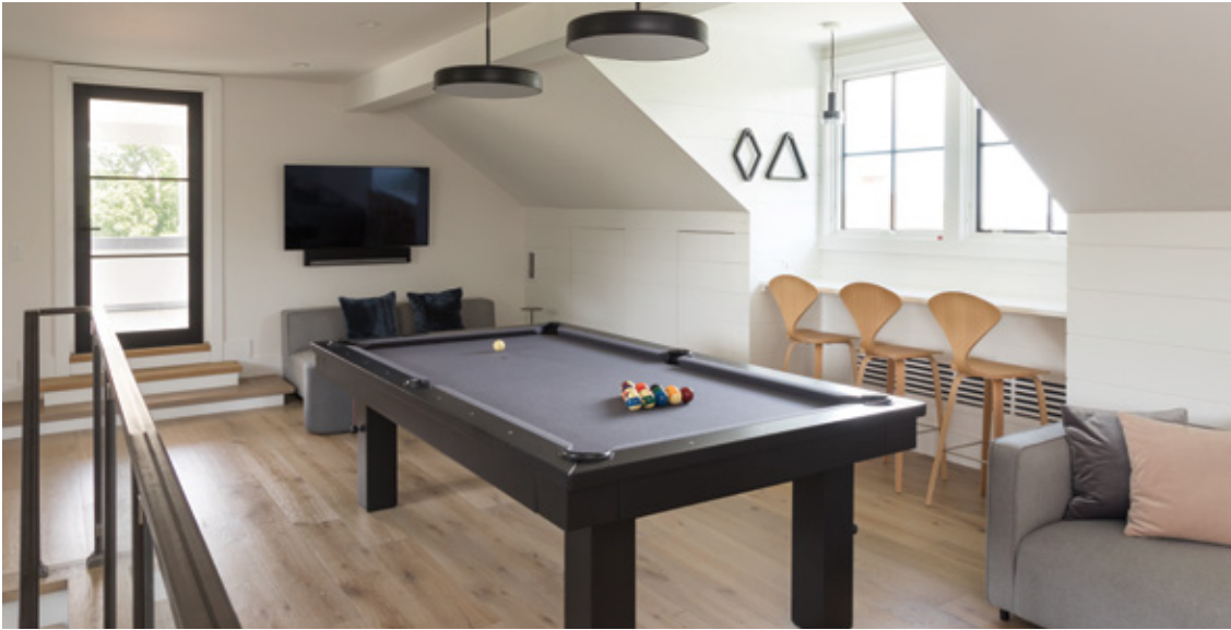
◀ In the recreation room is the homeowner's office, replete with pool table and breathtaking water views.