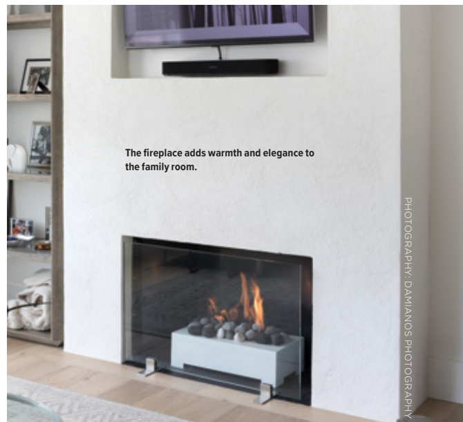
The fireplace adds warmth and elegance to the family room.