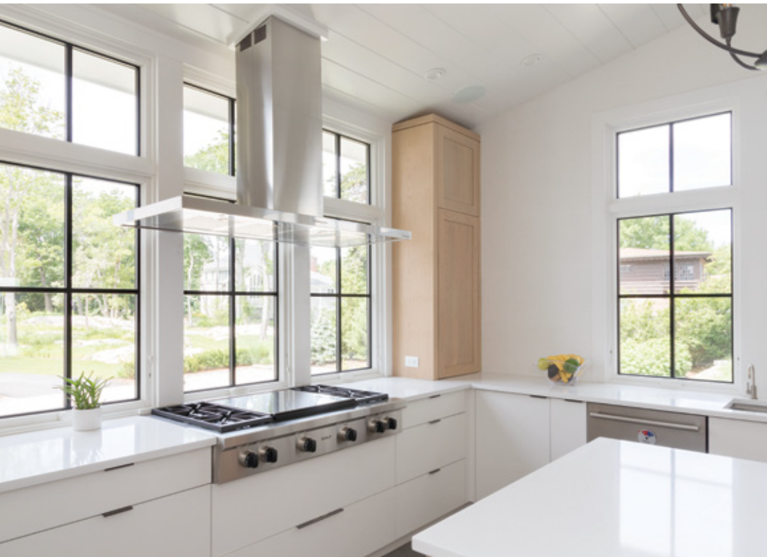
The kitchen involved some creative problem-solving. The homeowner knew what she wanted every step of the way, which included the oven hood to be framed against a bank of windows. In order for the building inspector to sign off on the hood placement, the team had to trim the windows with noncombustible quartz. Off the kitchen is the original wainscoted mudroom, one of the few spaces to survive the remodel.