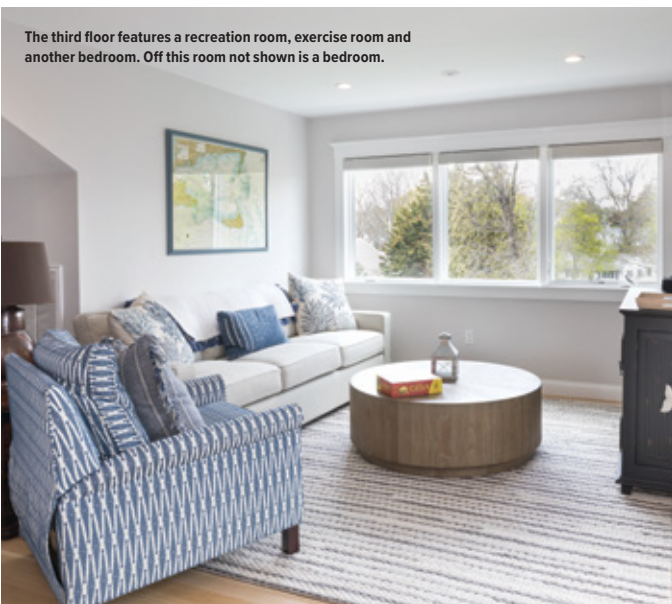
The third floor features a recreation room, exercise room and another bedroom. Off this room not shown is a bedroom.