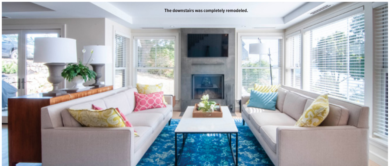
The downstairs was completely remodeled.