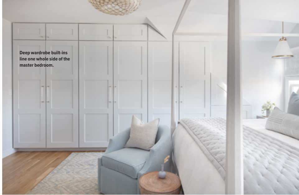
Deep wardrobe built-ins line one whole side of the master bedroom.