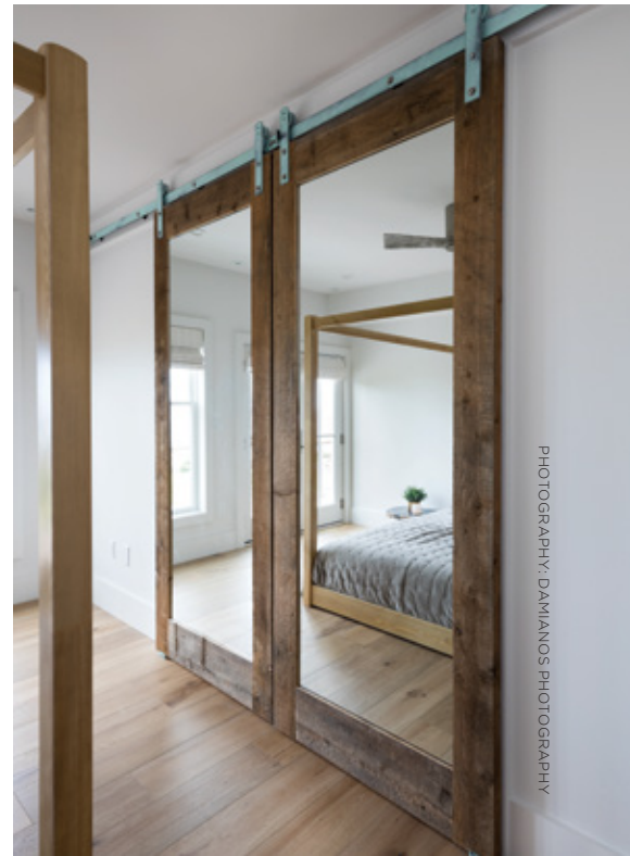
▶ A second bedroom features barn doors crafted from more salvaged floor joists that were taken up a design notch by the homeowner's desire to mirror the front of the doors, giving them a lot of character.