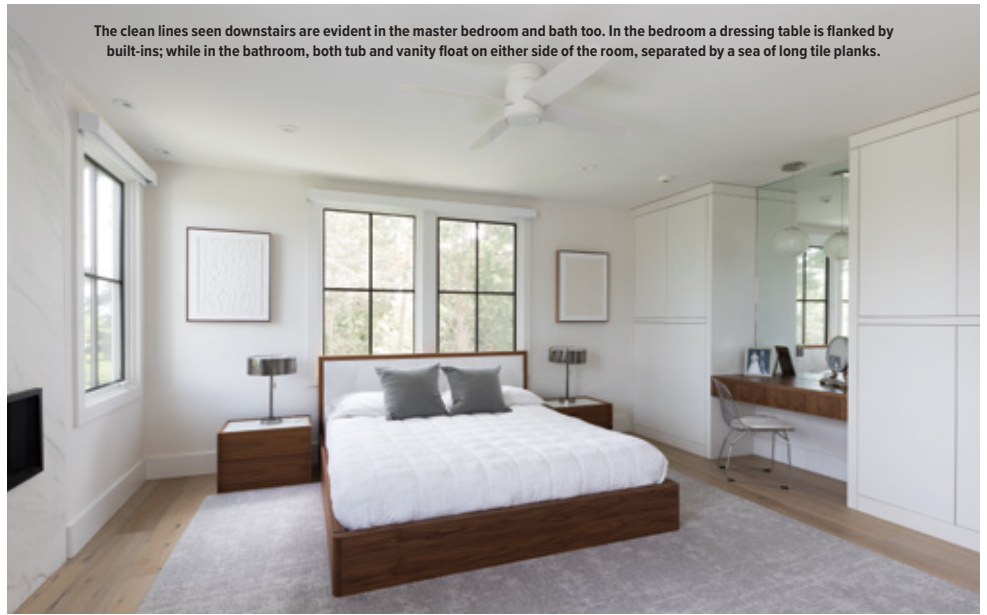
The clean lines seen downstairs are evident in the master bedroom and bath too. In the bedroom a dressing table is flanked by built-ins; while in the bathroom, both tub and vanity float on either side of the room, separated by a sea of long tile planks.