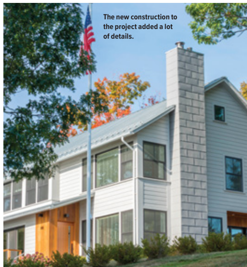
The new construction to the project added a lot of details.