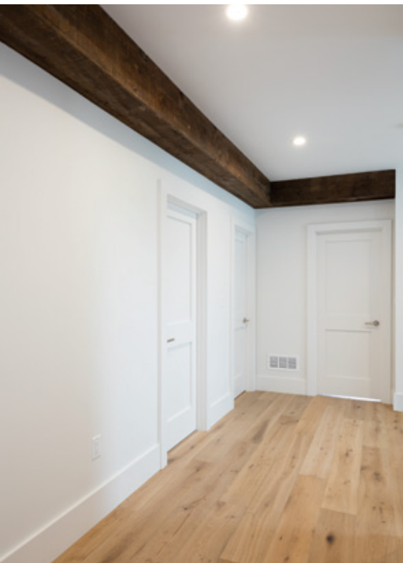
◀ The wide hallway features salvaged beams.