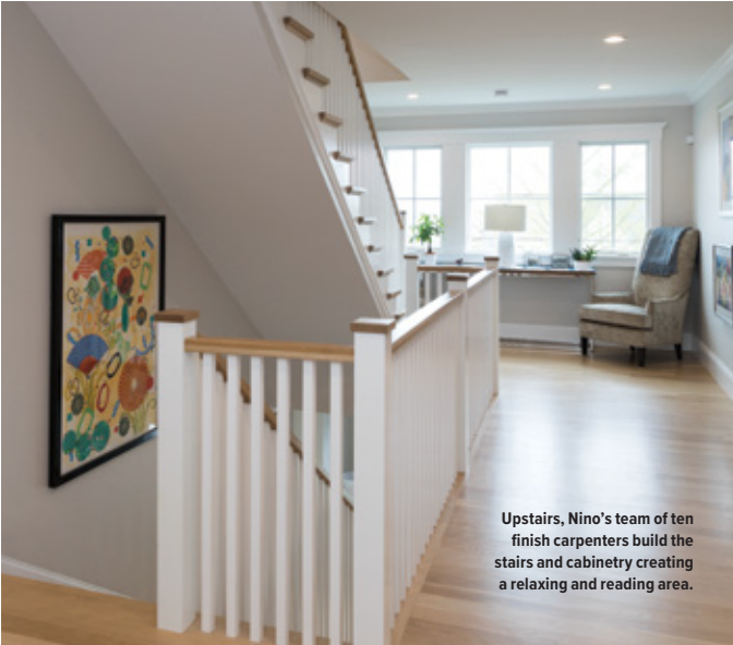
Upstairs, Nino's team of ten finish carpenters build the stairs and cabinetry creating a relaxing and reading area.