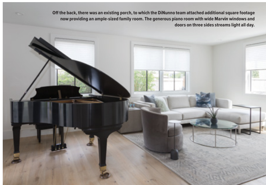
Off the back, there was an existing porch, to which the DiNunno team attached additional square footage now providing an ample-sized family room. The generous piano room with wide Marvin windows and doors on three sides streams light all day.