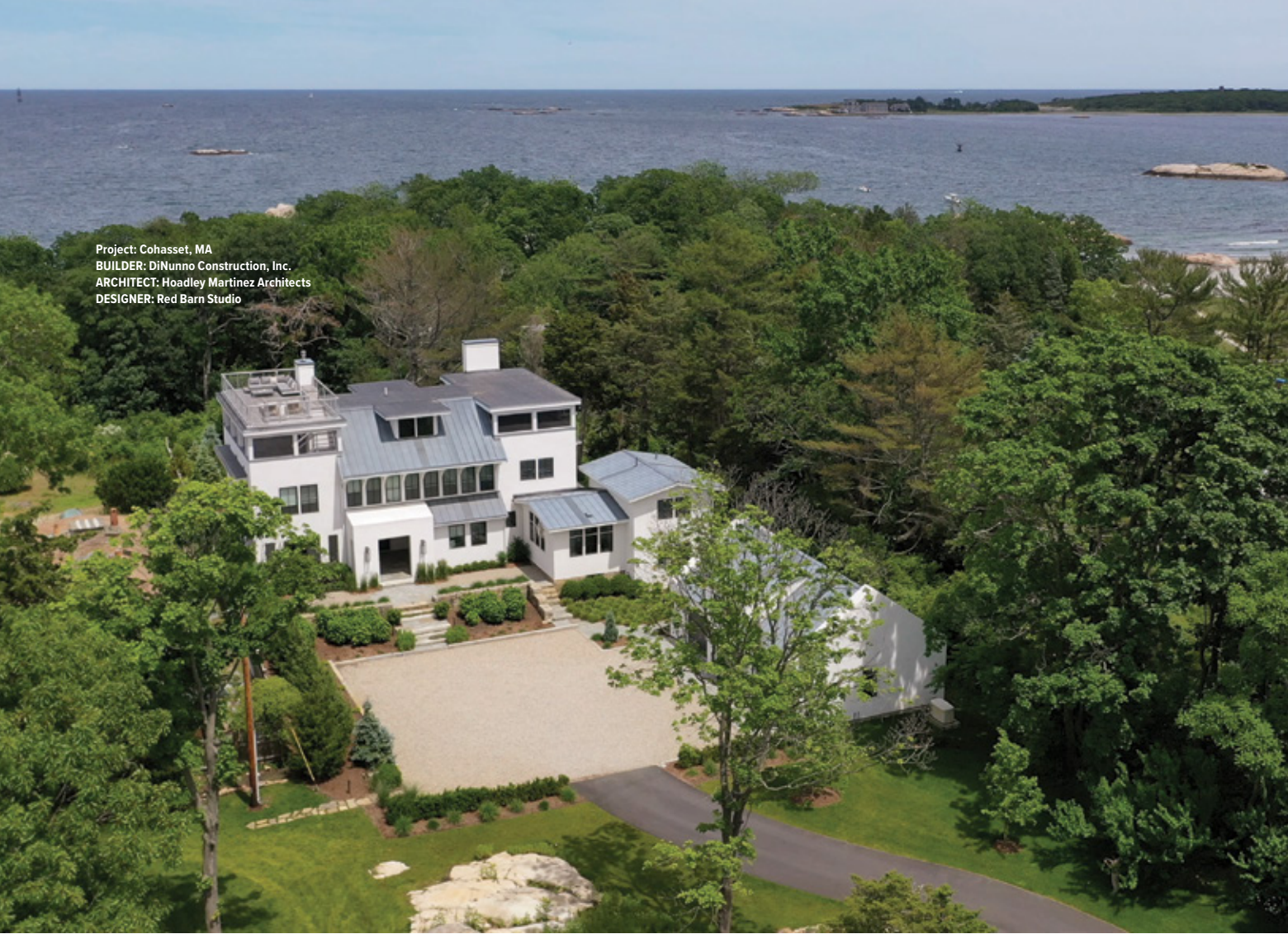
Project: Cohasset, MA BUILDER: DiNunno Construction, Inc. ARCHITECT: Hoadley Martinez Architects DESIGNER: Red Barn Studio