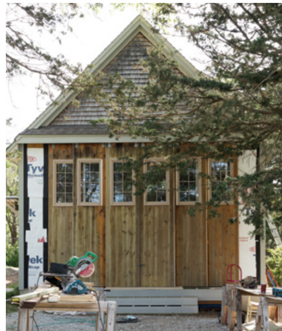
▶ The quaint carriage house is being converted into recreation space for the family and guests. Formerly, it had been constructed by the previous owner to accommodate his boat-building hobby.